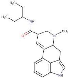
"L3A" - N-3-amyI-lysergamide (freebase) 6-methyl-N-(pentan-3-yl)-8,11-diazatetracyclo[7.6.1.0 2,7 .0 12,13 ]hexadeca-1(15),2,9,12(16),13-pentaene-4-carboxam